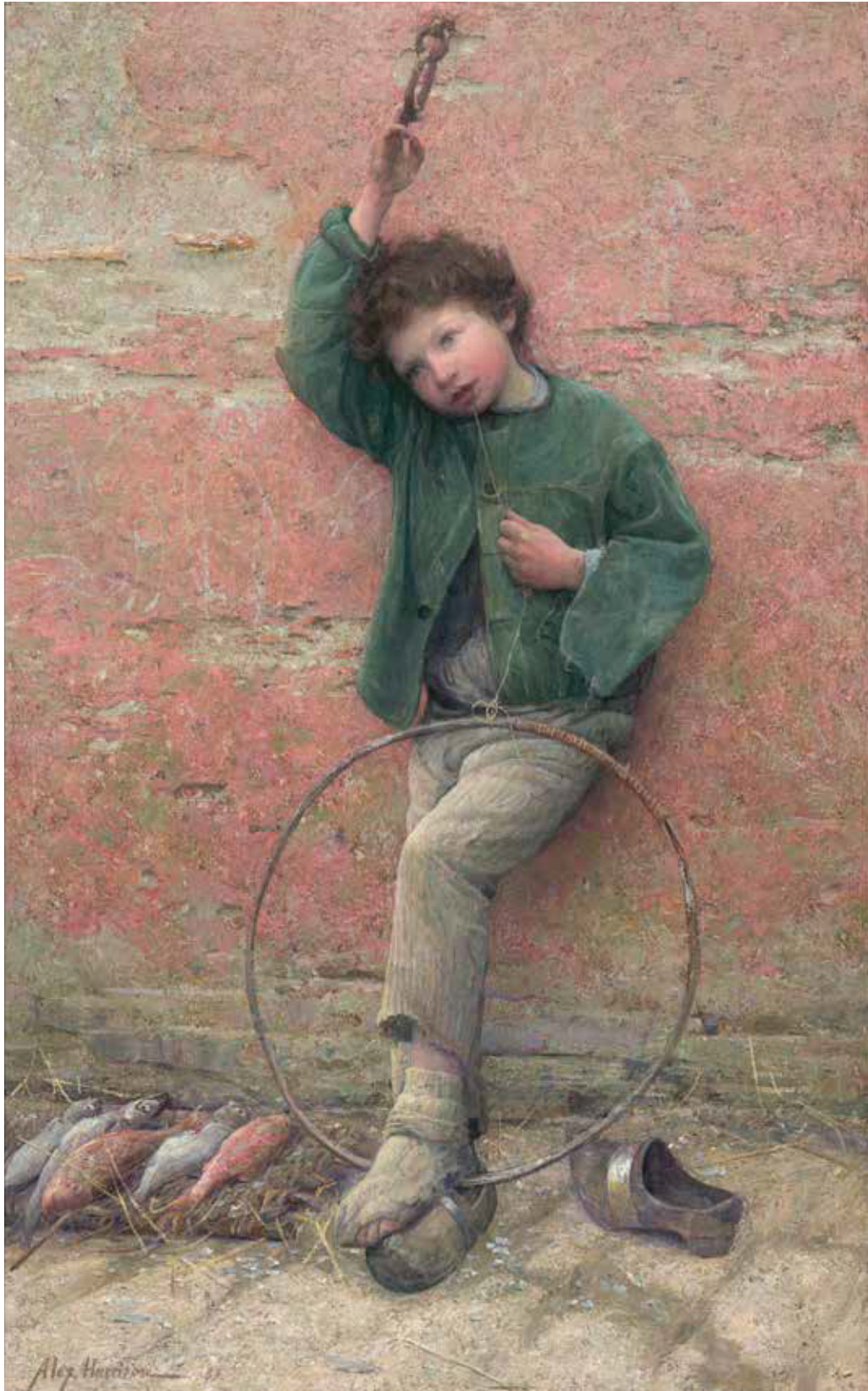
Alexander Harrison The Fisher Boy , 1883 Oil on canvas, 1925.129